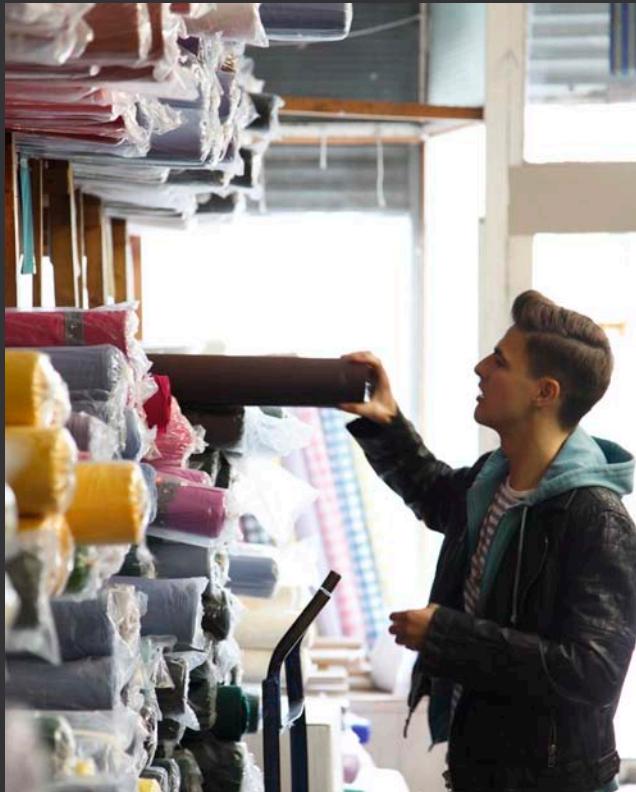
Lee in textiles heaven

“I’m just always looking up in London. Sometimes you’ll see the side of a building and I can see a coffee table instead...”