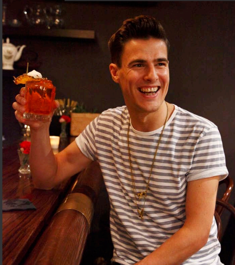
Cocktail shakers and oodles of old school glamour