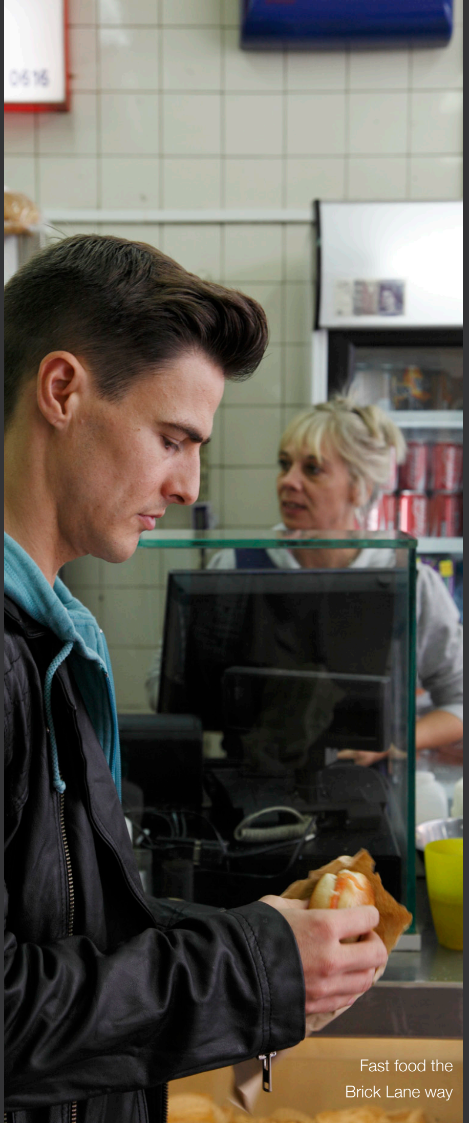
Fast food the Brick Lane way

“I’m just always looking up in London. Sometimes you’ll see the side of a building and I can see a coffee table instead...”