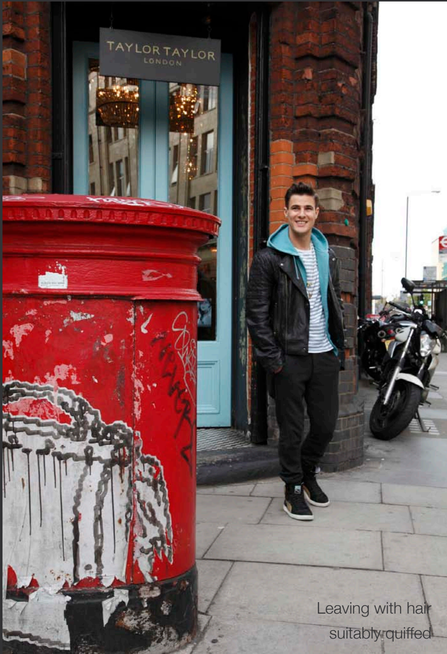
Leaving with hair suitably quiffed